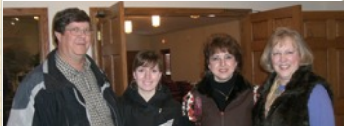
....meeting friends that become family.