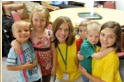
....sharing the gospel